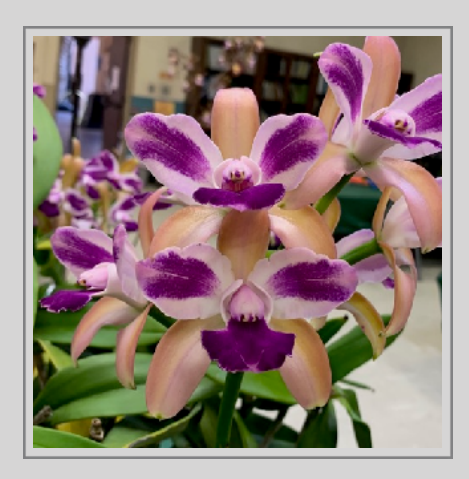
C. San Diego Variable 'Lemon Grove' HCC/AOS Exhibited by O.J. Bromfield