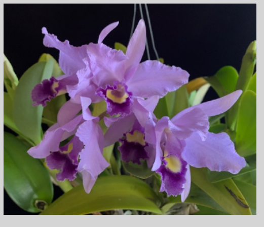
Ctt. Wendlandiana 'Liquid Blue'

December 20, 2024 Orchid Odyssey San Diego Zoo sandiegozoo.org