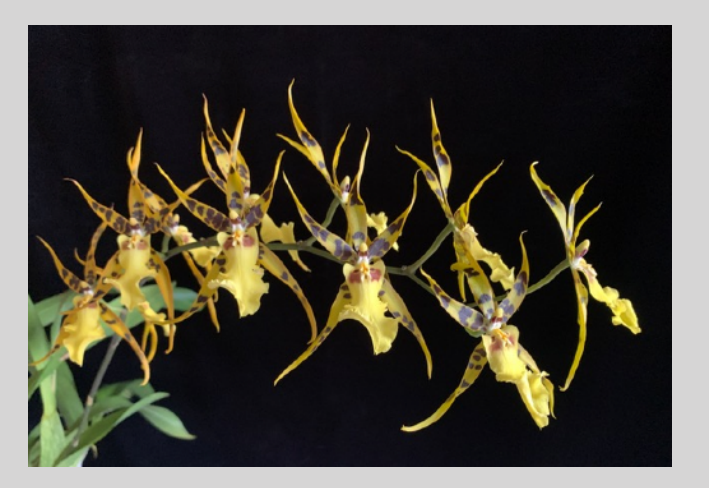
Alcra. Pacific Nova 'Okika'.

December 20, 2024 Orchid Odyssey San Diego Zoo sandiegozoo.org