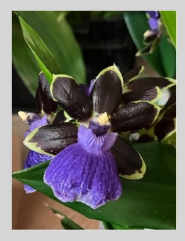
Intergeneric Zygopetalum #3