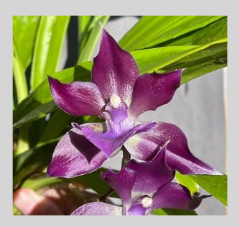
Intergeneric Zygopetalum #1