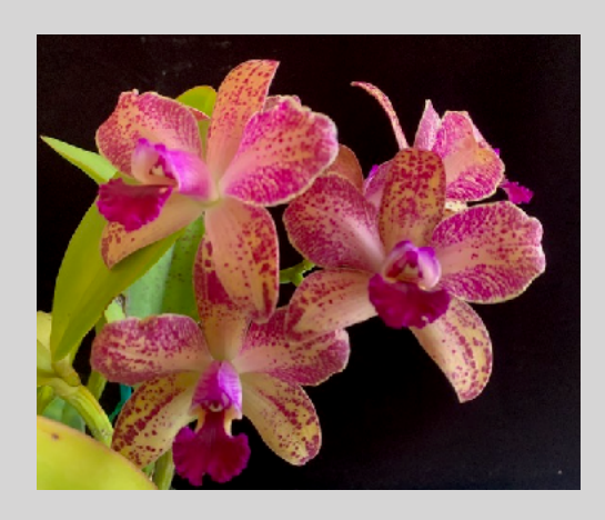
Blc. San Diego Hotspots