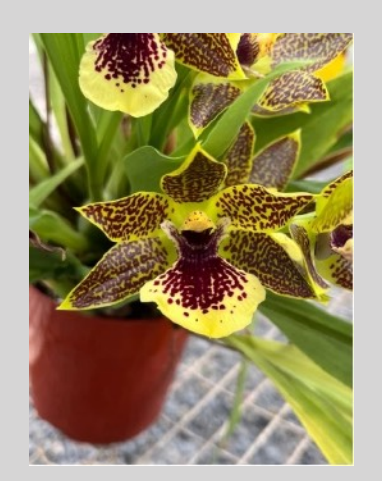
Intergeneric Zygopetalum #2